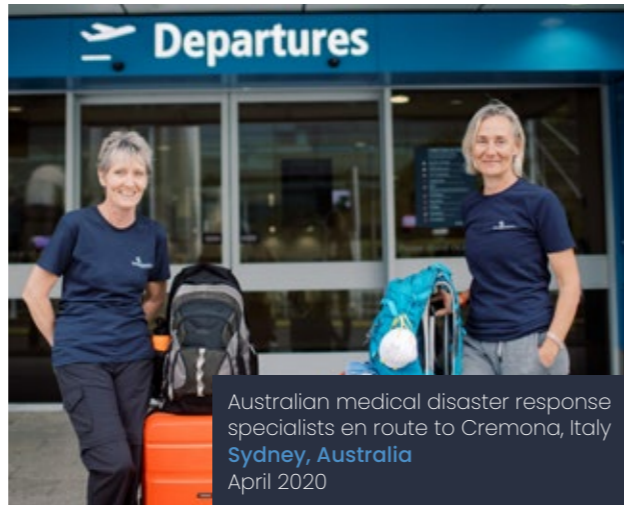
Australian medical disaster response specialists en route to Cremona, Italy Sydney, Australia April 2020

Thanks be to God, Francesco was removed from a ventilator after several days in intensive care and transitioned to step-down medical