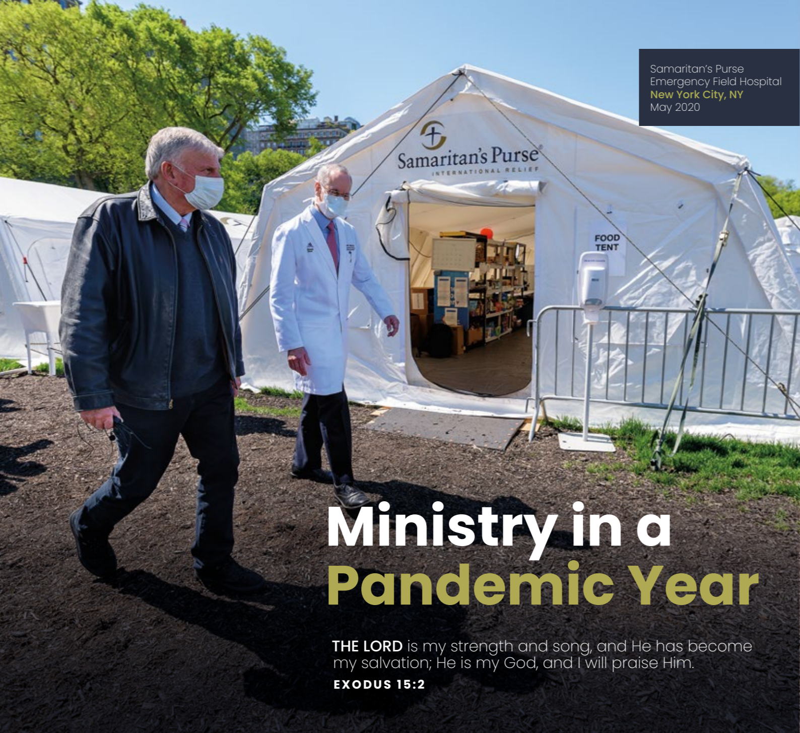
Samaritan's Purse Emergency Field Hospital New York City, NY May 2020