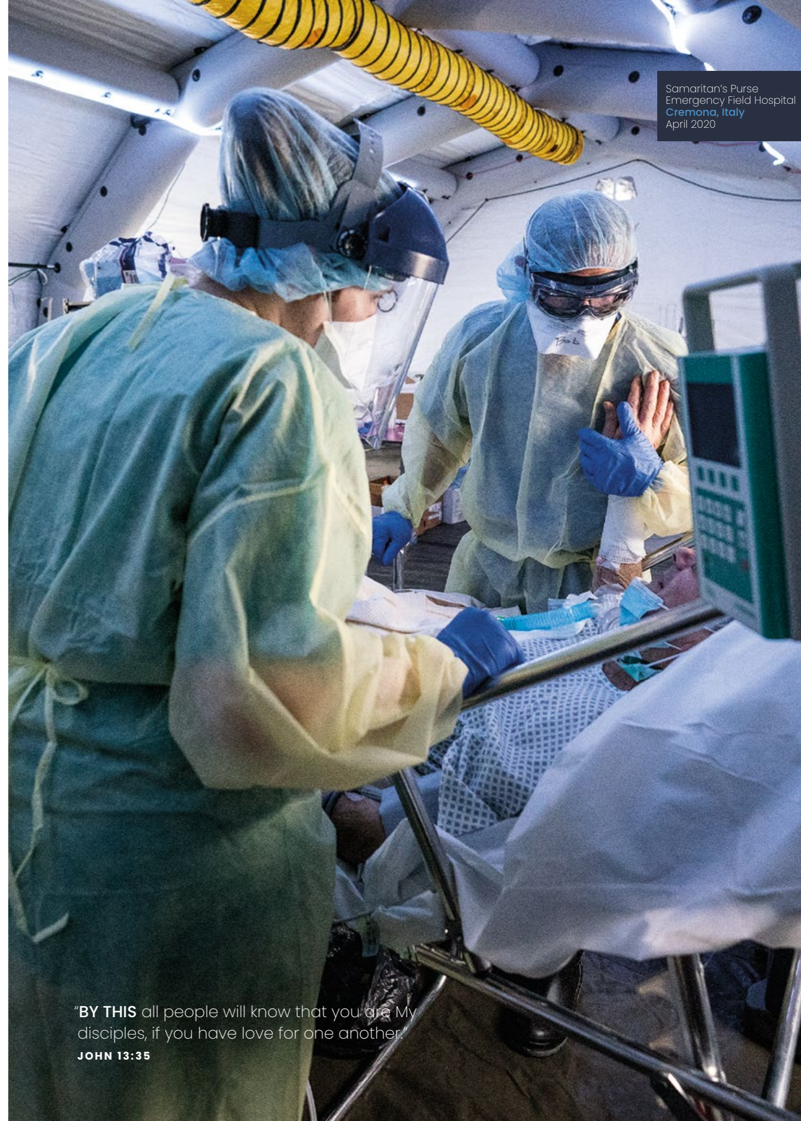
Samaritan's Purse Emergency Field Hospital Cremona, Italy April 2020

In addition to our medical response, Samaritan's Purse worked in 24 countries to meet the needs of vulnerable communities and prevent the spread of the virus. We trained 878,289 people in prevention measures, and distributed 489,573 protective supplies and 147,458 hygiene kits. Our teams also provided more than 28,000 food hampers to families whose livelihoods were threatened by the economic impacts of the coronavirus. Through these efforts, more than 120,479 people were encouraged and comforted in Jesus' Name.