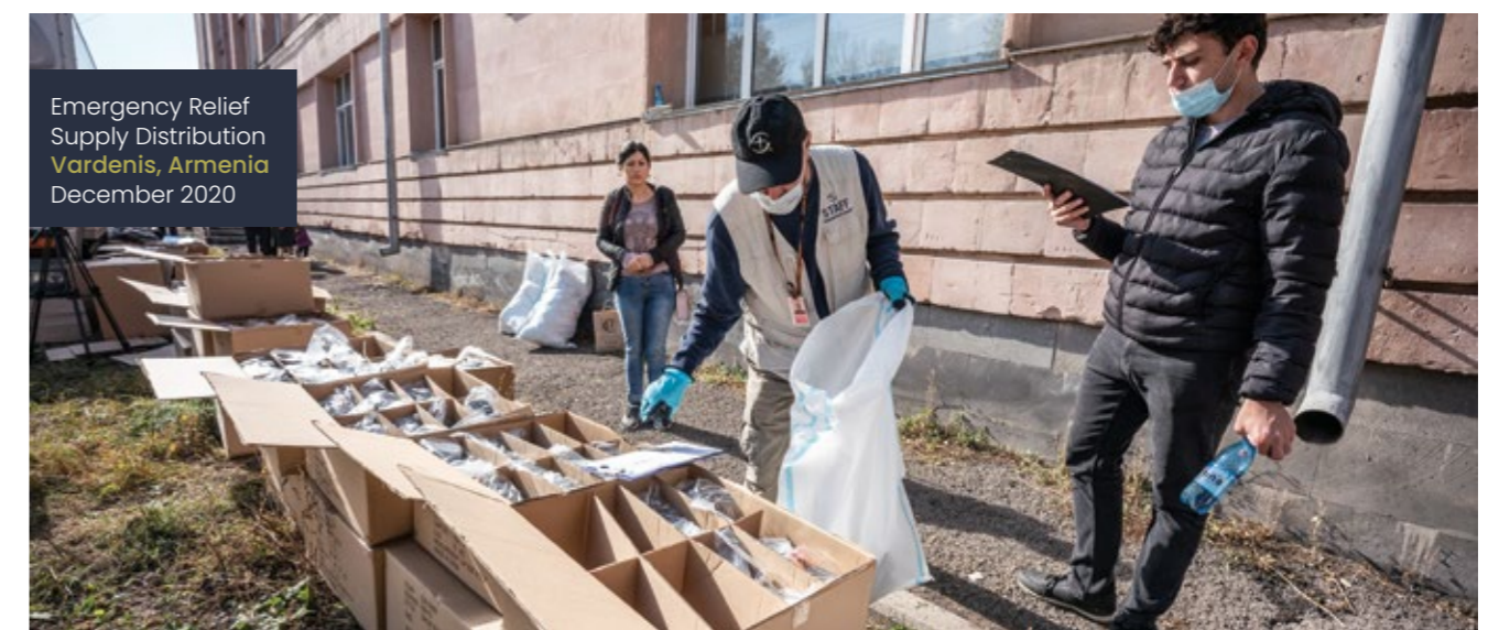
Emergency Relief Supply Distribution Vardenis, Armenia December 2020