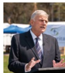
INTERNATIONAL PRESIDENT, FRANKLIN GRAHAM